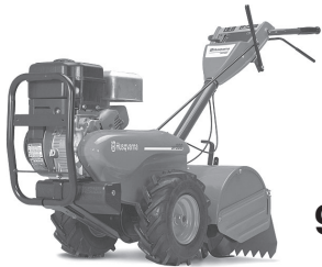
DRT 900 E

Electric start, 17" dual rotating tines, reg. $799.99